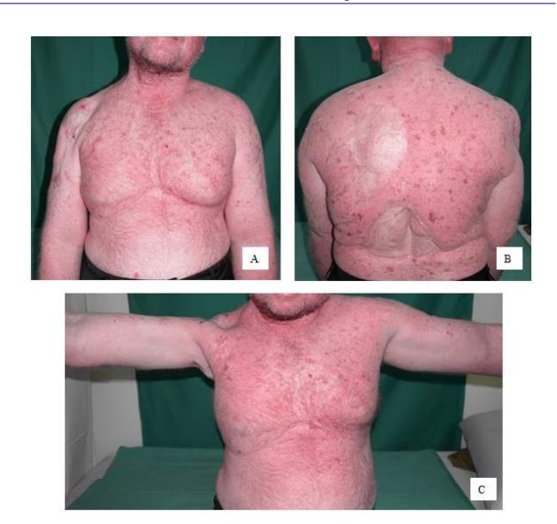
Figure 2. (A, B) Contour of the right shoulder is almost similar with the left shoulder. (C) Full abduction.