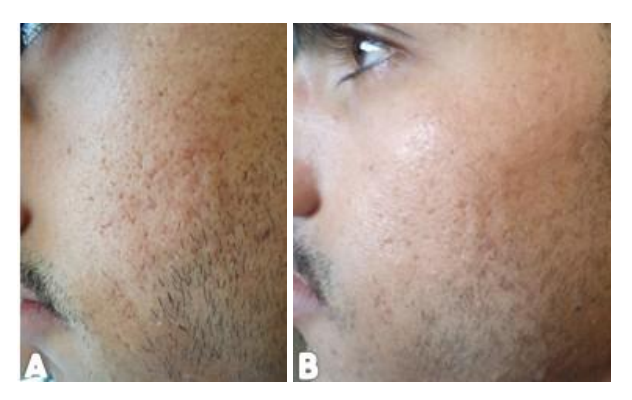
Figure 2. (A) Left side of the face of male patient with mixed atrophic acne scars; (B) The same patient three months after scar subcision with autologous fat transfer