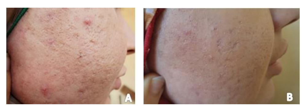
Figure 1. (A) Right side of the face of female patient with mixed atrophic acne scars; (B) The same patient three months after scar subcision with autologous fat