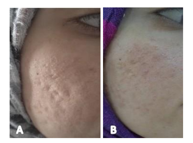
Figure 3. (A) Right side of the face of female patient with mixed atrophic acne scars; (B) The same patient three months after the last session of fractional ablative CO_2 laser