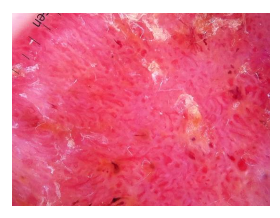
Figure 2A. Dermoscopy shows fine scales throughout the surface, "chalice-form" and "cherry-blossom" vascular structures. Some white-to-pink structureless areas and a linear coiled (glomerular) vessel were observed.