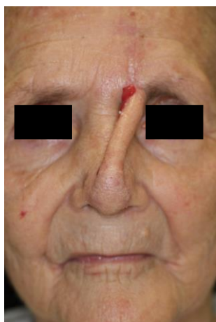
Figure 6. 4 weeks after the first stage