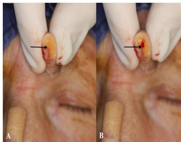
Figure 7. A) and B) Supratrochlear artery can be visualized after pedicle division (arrows)