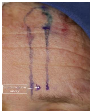
Figure 4. Paramedian forehead flap demarcated on the forehead. Pedicle based on the left supratrochlear artery