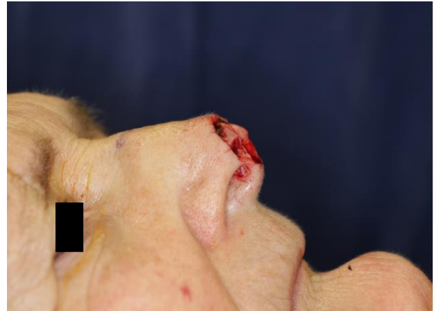
Figure 2. Important loss of volume of the nasal tip. Parts of the lower lateral cartilages were removed