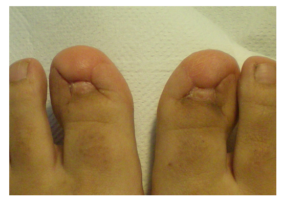
Figure 3. Late postoperative picture of the right and left great toes