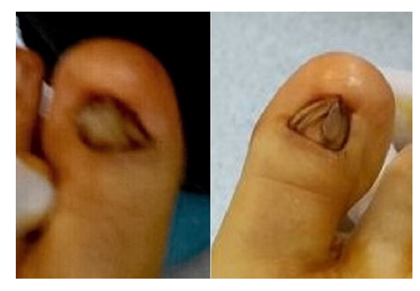
Figure 1. Preoperative picture of severe bilateral nail plate dystrophy involving great toe (A) left, (B) right.

pressure. The patient was restricted for 14 days and normal activity was allowed after suture removal following this period. The patient healed without any problem and her nail problem was treated successfully. The cosmetic appearance of her first toes was acceptable 8 months after operation (Figure 3). There was no regrowth of nail plates bilaterally. Effective and stable soft tissue coverage of dorsal surface of distal phalanx bone was provided by the thick plantar skin transferred dorsally by using the triple advancement flap method.