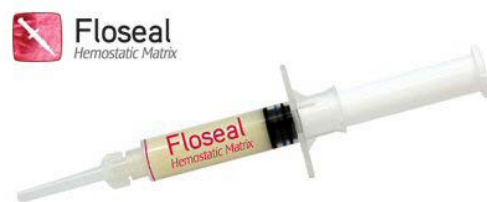
Figure 1. Floseal®, 5 mL of haemostatic matrix

The blood loss was estimated based on the blood loss from the operation site and the blood collected from the drain.