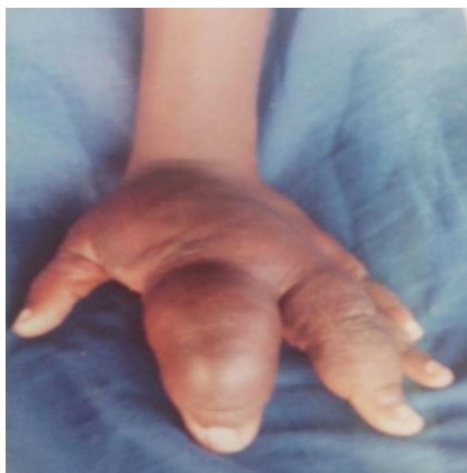
Figure 2. Vascular malformations: lymphatic and venous malformation of the hand

We found only one post-operative complication as a pyoderma in a patient who presented an enormous lymphatic venous malformation in the arm (the Klippel-Trenauney syndrome) that was excised, drained. It healed within two weeks.