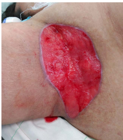
Figure 2. Right axillary defect following surgical excision of hidradenitis suppurativa