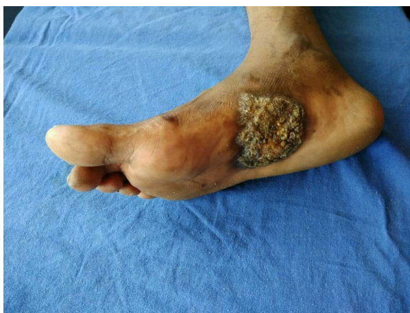
Figure 1. The lesion on the right foot