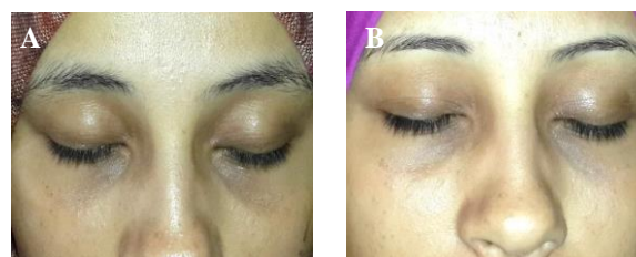
Figure 3. Patient with PODC as seen before (A), and after (B), chemical peeling treatment, who was diagnosed as pigmented type grade 3 PODC and showed fair improvement