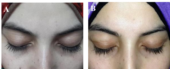
Figure 6. Patient with PODC as seen before (A), and after (B), the treatment of carboxytherapy, who was diagnosed as pigmented type grade 2 PODC and showed fair improvement