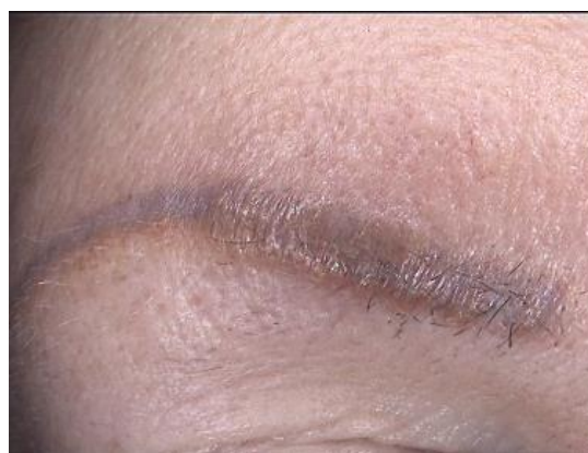
Figure 5. Granuloma after PMU treatment

Aside from potential aesthetic issues, PMU also carries along a certain risk of medical complications, as does every tattoo. The risk of infections, wound healing complications, keloids, and hypertrophic scars can never be completely eliminated. In very rare cases, eyelid necrosis or ectropion can occur. Lastly, even the inserted colour can lead to negative reactions such as granulomas or allergic reactions (Figure 5).