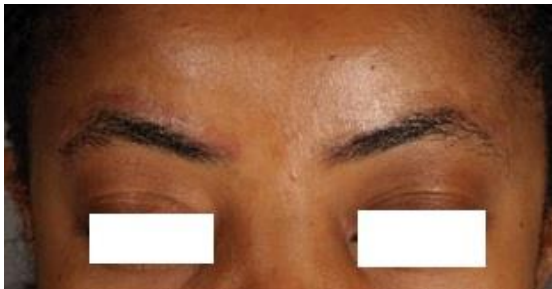
Figure 7. After treatment

The skin depth that the laser light is able to penetrate depends on the wavelength and the size of the spot on the laser. Longer wavelengths and bigger spots lead to an increased penetration depth.