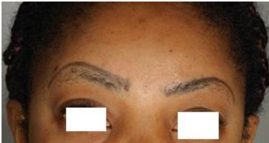
Figure 6. Wrong sited PMU before treatment

of the pulse has to be briefer than the thermal relaxation time. If these guidelines are followed properly, an unspecific heating of the surrounding skin can be avoided [6] leading to scarring in less than 5% of cases. In the case of multi-coloured PMUs, different wavelengths have to be combined (Figures 6 and 7).