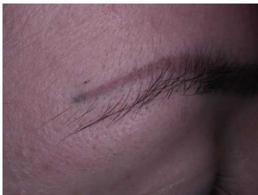
Figure 2. Wrong site, colour change

Most of the time, patients in this situation trustfully consult their aesthetician, who offers a skin-coloured cover-up tattoo which is placed right over the failed PMU tattoo. Although this perceived solution sounds very easy, it rarely leads to satisfying results as it often looks unnatural in addition to not fully covering up the original tattoo. Since it cannot adjust to the tanning of the skin, it subsequently becomes very visible during summer. Therefore, an aesthetician should not attempt to cover a tattoo. One should consult a doctor and work out a solution with a dermatologist who specialises in laser medicine (Figures 3 and 4).