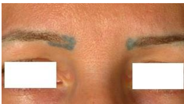
Figure 9. Discolouration of a skin-coloured PMU after laser treatment

To avoid such complications, a test-treatment should always be performed on a hidden area of the skin in order to observe how the skin and colour react to the laser. Patients should also be informed that this treatment will take more than a few sessions and that they have to live with a work in progress for some time ( Figure 9 ).