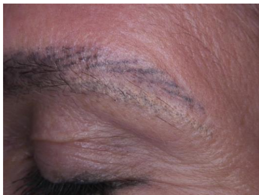
Figure 3. Misplaced skin-coloured cover-up

Most of the time, patients in this situation trustfully consult their aesthetician, who offers a skin-coloured cover-up tattoo which is placed right over the failed PMU tattoo. Although this perceived solution sounds very easy, it rarely leads to satisfying results as it often looks unnatural in addition to not fully covering up the original tattoo. Since it cannot adjust to the tanning of the skin, it subsequently becomes very visible during summer. Therefore, an aesthetician should not attempt to cover a tattoo. One should consult a doctor and work out a solution with a dermatologist who specialises in laser medicine (Figures 3 and 4).