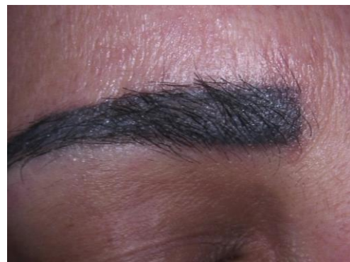
Figure 1. Wrong shape, too dark

wrong colour choice, site, shape, or a procedural mistake ( Figures 1 and 2 ).